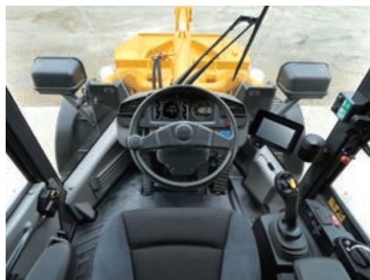
New operator seat and optional new joystick steering for maximum operator comfort.