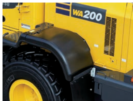
New full rear fenders are standard.