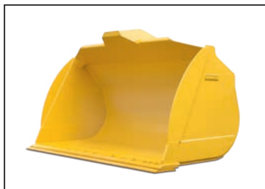
New, high efficiency buckets with new shape for easier and more efficient material handling.