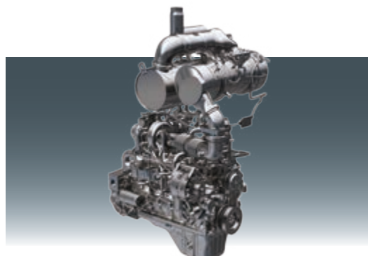
New, low consumption EU Stage IV Komatsu SAA4D107E-3 engine.